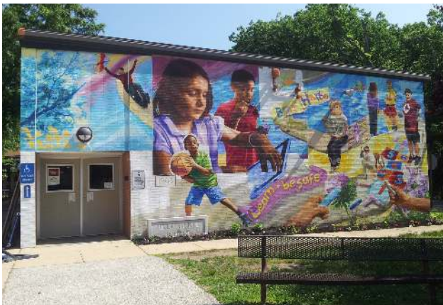
Perkins Center ARTS Residencies help schools support social, emotional, and academic growth through the arts.