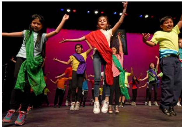
ARTS Residencies promote perseverance, collaboration, problem solving and communication skills in students.