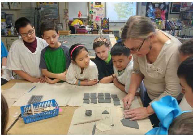
Teaching Artists enrich classroom learning with hands-on experiences individually designed to fit your school goals.